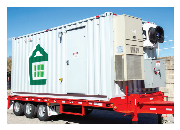
PICTURED: PROMIS trailer

PROMIS' platform is equipped with integrated microgrid technology and an on-board controller that provides comprehensive sets of autonomous controls, optimization schemes, and supervisory capability for ease of remote operator access and integration back to the Dispatch Center for overall grid coordination.